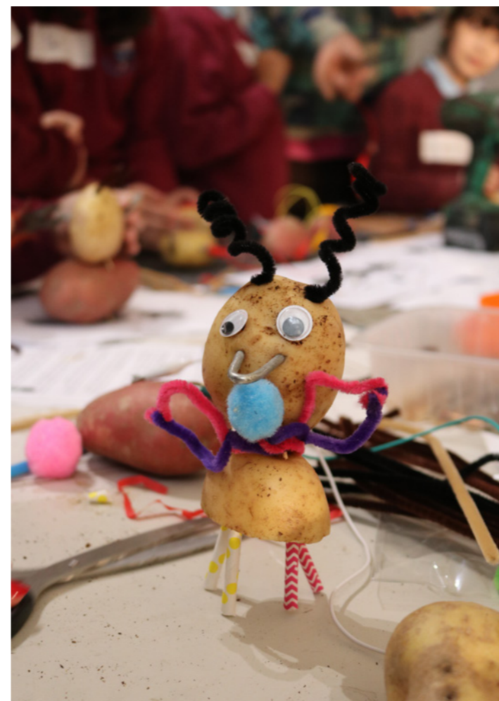
Paddy Bloomer and Fane Street Primary School